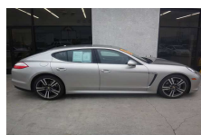
2012 Porsche $56,666 22,642 miles