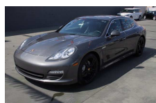
2013 Porsche $64,995 20,404 miles