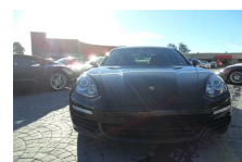
2014 Porsche $60,900 28,900 miles