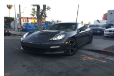
2013 Porsche $57,990 22,757 miles